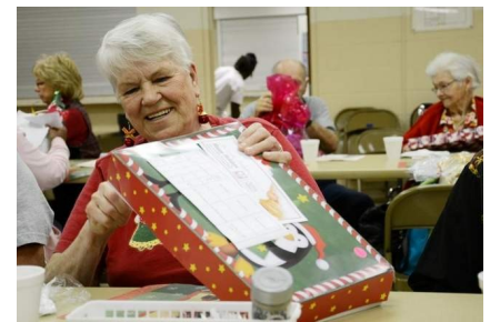
Picture from Florida Today article, “Volunteers brighten seniors’ Christmas.”

During the holiday season, Florida Today printed several articles highlighting the impact this project had on the lives of Brevard County’s seniors aging alone.